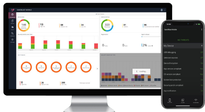
Harmony Mobile Management Console